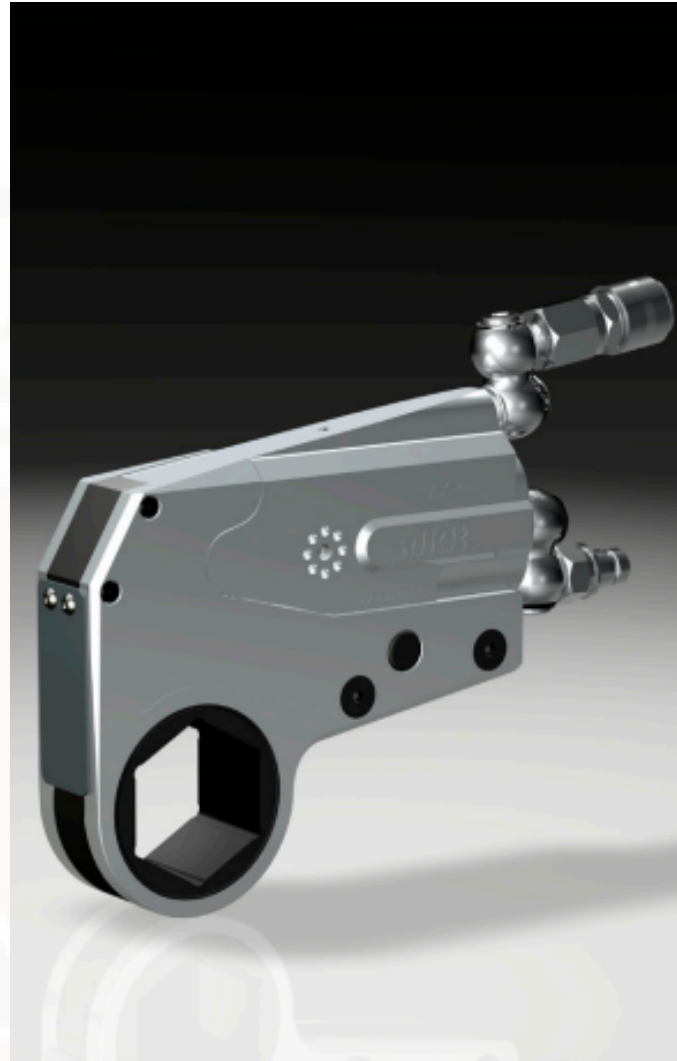
Model alkitronic® H-AX