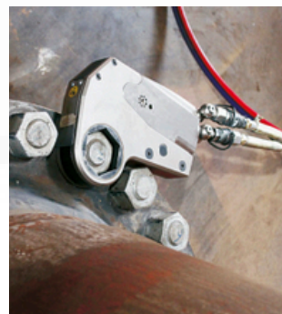
alkitronic® H-AX , when fitting a flange in plant construction.

Important for the exact reproducibility of the specified torque is a pressure of max. 700 bar. Repeatability ±3%. For a fast, safe and reliable operation of the hydraulic torque wrenches we recommend our alkitronic® NOVA or alkitronic® VELOX hydraulic pumps (700 bar pressure, can be used worldwide in all mains grids 100-253 V / 45-66 Hz).