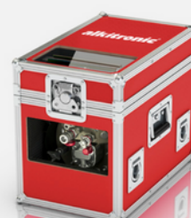
alkitronic® NOVA multibox

Robust design with load hooks and handles, certified for crane transportation.