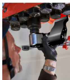
alkitronic® H-AT Use in a wind power plant