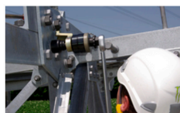
alkitronic® M-HG operating on electricity pylons. Accurate tightening via torque wrench.