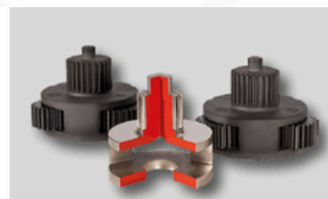
alkitronic® - power gear components

Specifications Torque Multiplier input via: 3/4" internal square socket torque wrench or conventional ratchets external hexagonal socket AF 36 mm. Handwheel - for rough turning loose bolts/nuts. alkitronic® manual torque multipliers are supplied with a support foot (DMA) as standard version. For support rings, backstops, ratchets, torque wrenches, and other components, please see our alkitronic® catalog of accessories. alki TECHNIK GmbH reserves the right to change specifications without prior notice.