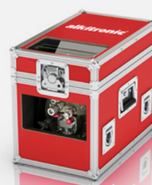
alkitronic® NOVA multibox

Robust design with load hooks and handles, certified for crane transportation.