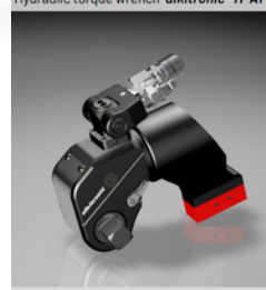
Hydraulic torque wrench alkitronic® H-AT

We recommend our hydraulic torque wrenches for secure and reliable tightening or loosening of heavy bolt connections.